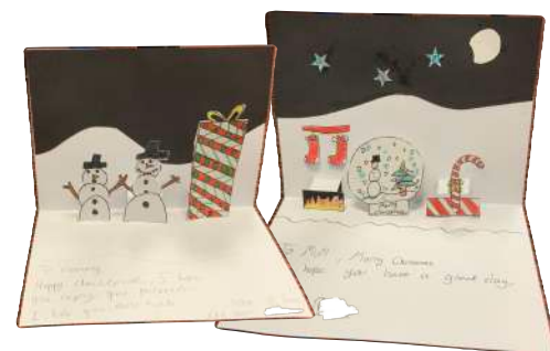
Year 6 made pop up Christmas cards for their family members ✨