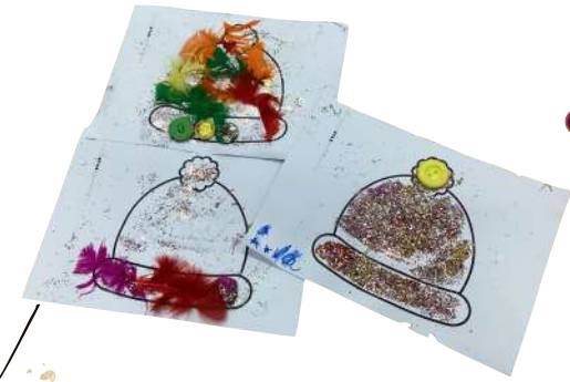
Reception decorated hats in a variety of different ways 🧢

On the 5th December, the children had some time to make winter-themed crafts. Here are some examples from each year group.