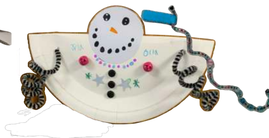
Year 5 made an assortment of festive themed decorations 🧊