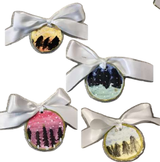
Year 4 also made some beautiful painted baubles, tied together with some pretty ribbon 🎀