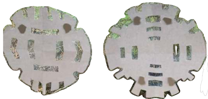
Year 3 made snowflakes out of paper ❄️