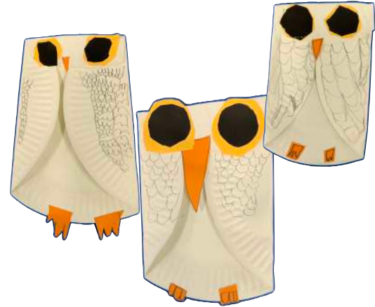
Year 2 made some fabulously festive snowy owls using paper plates 🦉