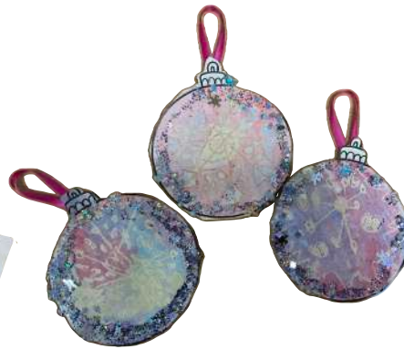
Year 1 made some beautiful baubles and decorated with glitter to finish ✨