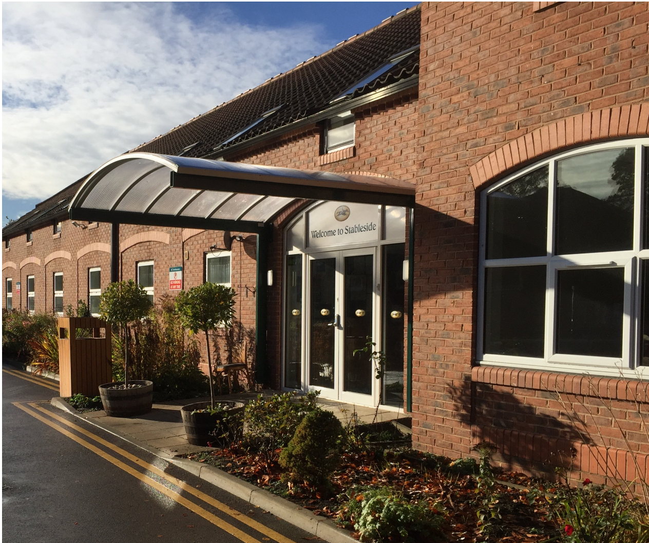
Accommodation Stableside – York Racecourse