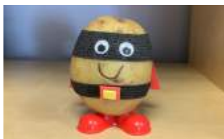
1J - SIMRAN - SUPERTATO