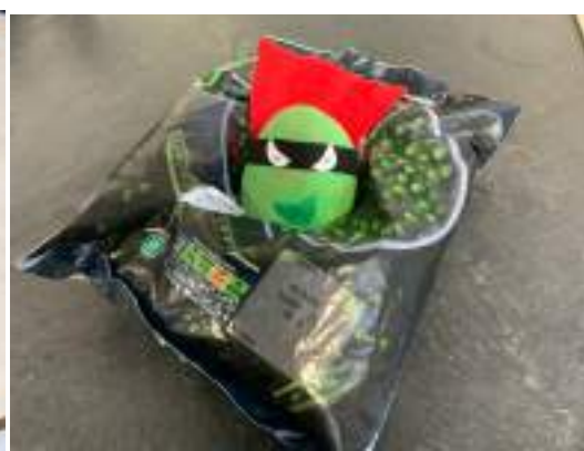
1H - RAIFE'S - EVIL PEA FROM SUPERTATO