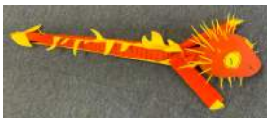
2C - HUGO - FANTASTIC BEASTS AND WHERE TO FIND THEM