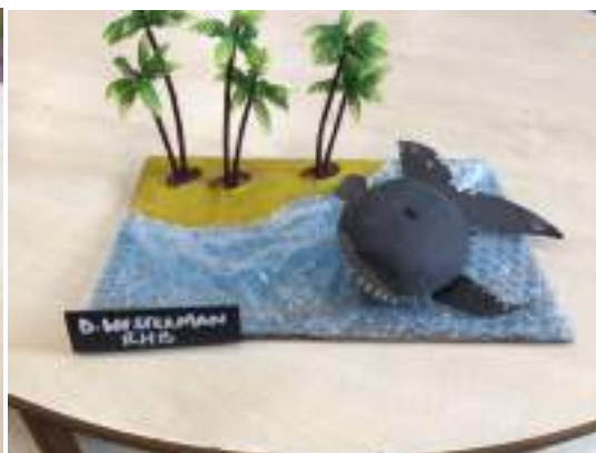
RHB - DEVON - SNAIL & THE WHALE