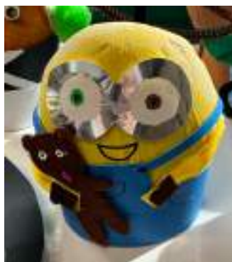
5F - HARPER - MINIONS