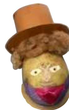
5MM - EBEN - WILLY WONKA