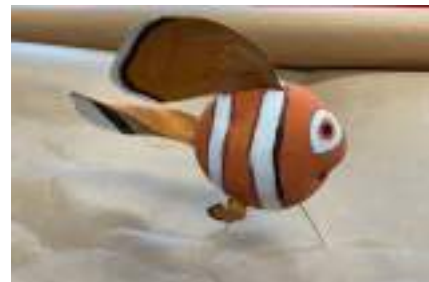
2KJ - EDITH - FINDING NEMO