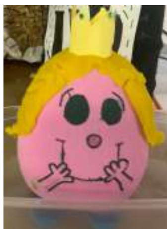
3CP - MILLIE - LITTLE MISS PRINCESS