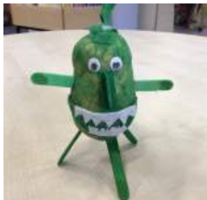
RC - SHAKAYA - DINOSAUR DINOSAUR, SAY GOODNIGHT