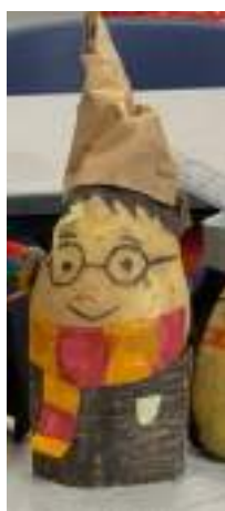
3C - AMELIE - HARRY POTTER