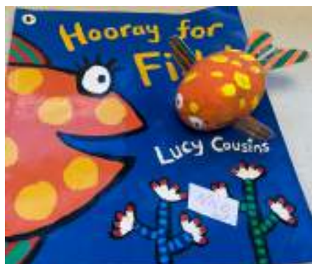
4CF - NICO - HOORAY FOR FISH